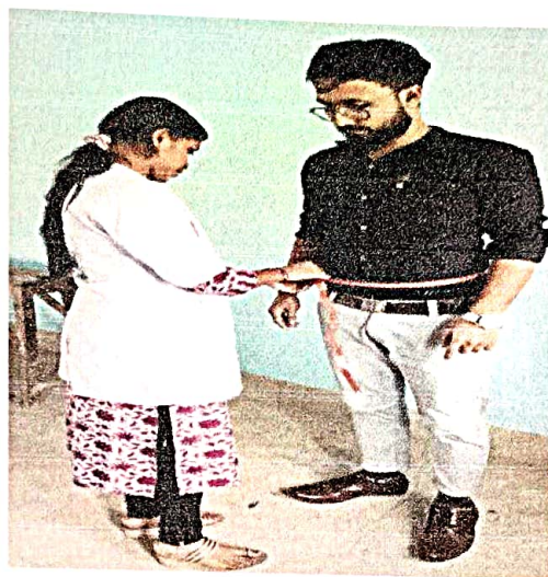
Plate 2: Different activities during survey of Non-Smoker of Khejuri -I Block area