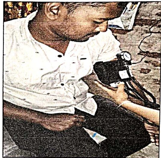
Plate 1: Different activities during survey of Smoker Khejuri 1Block area